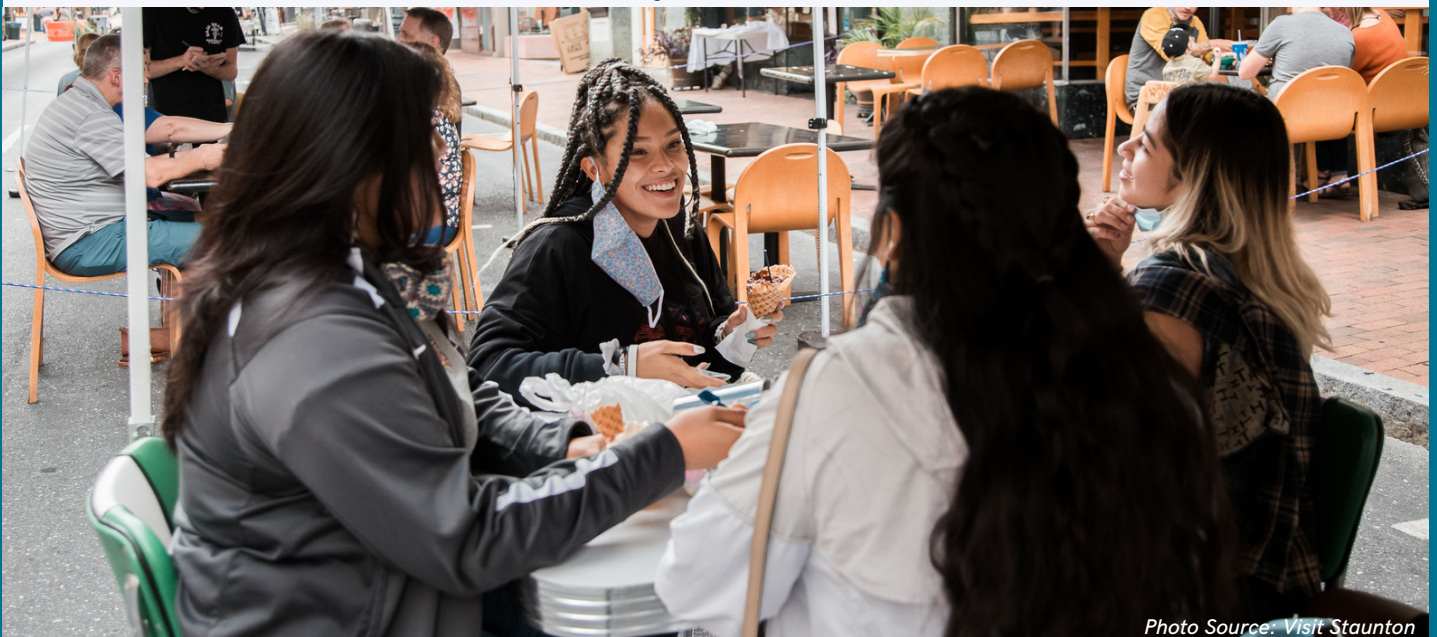
Outdoor dining in Downtown Staunton

Support and encourage downtown and storefront businesses.