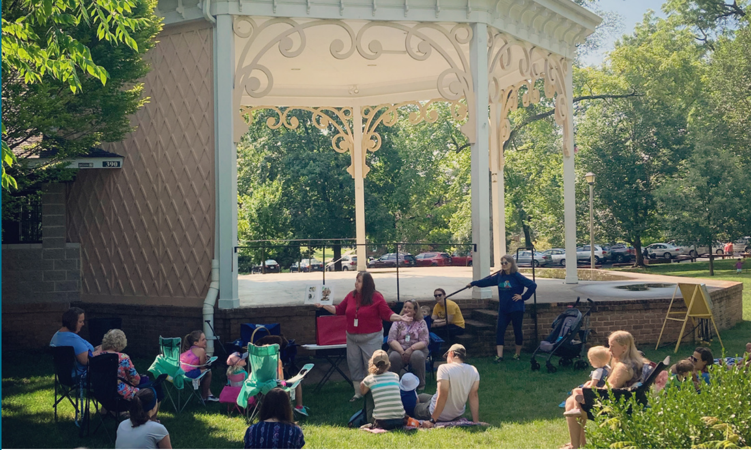
The Staunton Public Library held socially-distanced outdoor story time sessions in Gypsy Hill Park and other locations around the community.